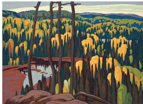
Algoma Country, 1948 [Our Sister Mother Earth?]

Lawren Harris, founder of the Group of Seven: The spirituality of his art : the metaphysics of this Canadian’s abstract landscapes where the universe sings especially in what we do call Sister Mother Earth, and could call Brother Mountain and Sister Iceberg. Read More