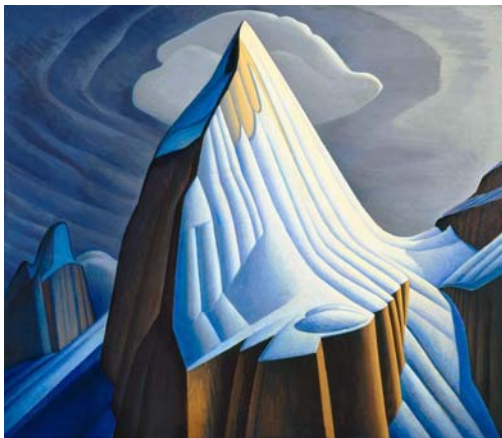
Mt. Lefroy, 1930 [Brother Mountain?]

“The entire material universe speaks of God’s love, his boundless affection for us. Soil, water, mountains: everything is, as it were, a caress of God.” (Pope Francis, 2015, Laudato Si’ , 84)