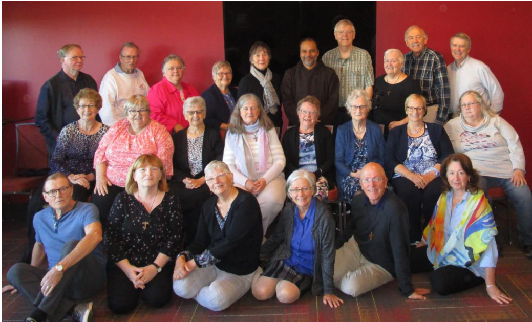
Participants in St. Francis of Assisi Annual Retreat 2019